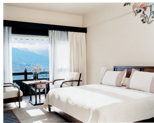
This image can be downloaded at: http://www.como.bz/download/paro/deluxe_room.jpg